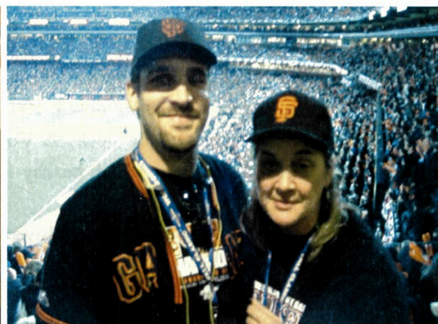
World Series Game 5